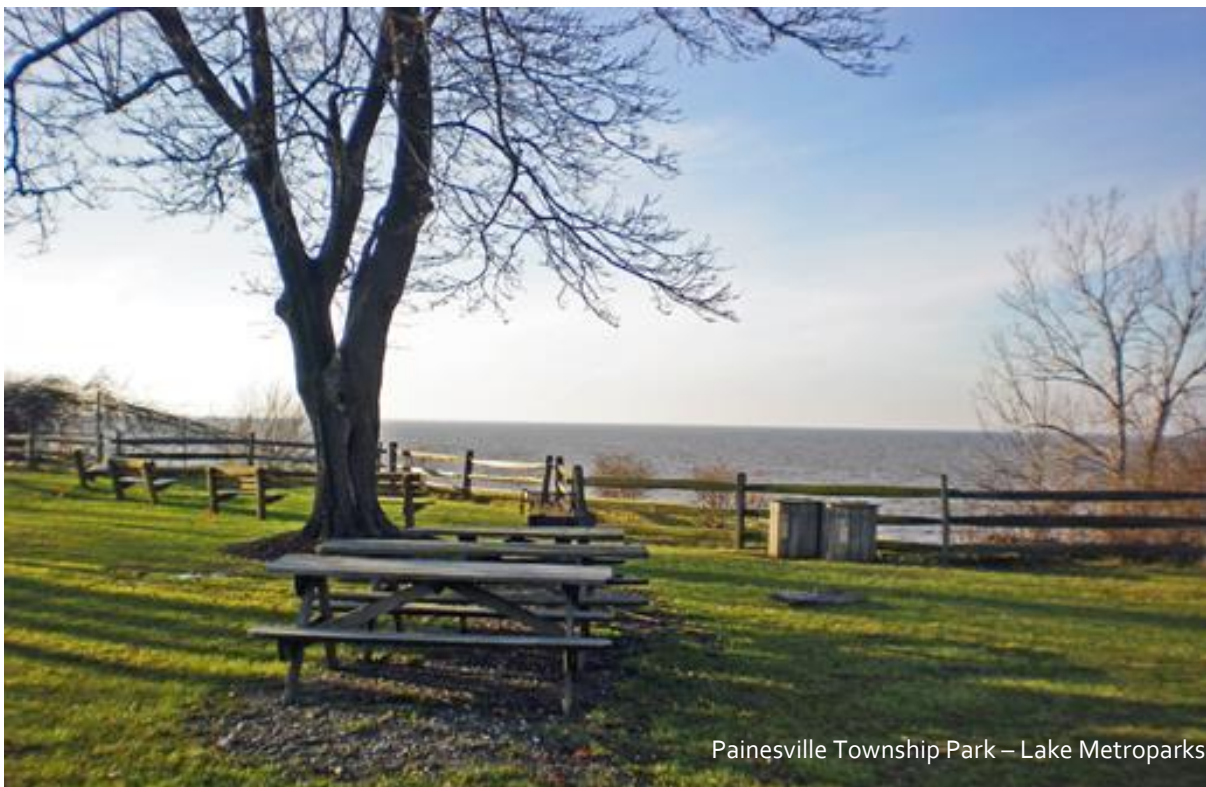
Painesville Township Park – Lake Metroparks

There are six public parks in Painesville Township, two of which include small portions of much larger parks. The 1996 Painesville Township Comprehensive Plan emphasized the growing need for more parks in the Township, especially neighborhood and community parks.